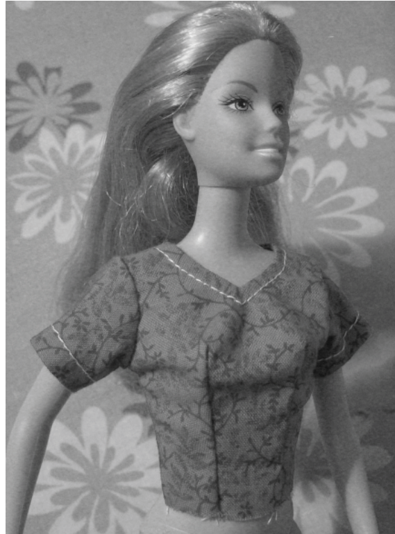
Basic bodice and sleeves for 1999 Bellybutton Barbie

Make sure to print at 100% scale. To confirm correct printing size, verify that this picture printed out to be 4" tall.